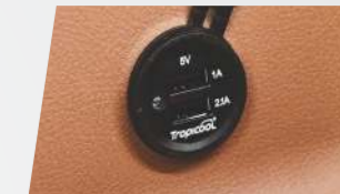
Dual Port USB Fast Charger