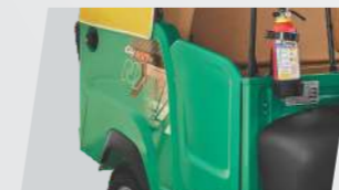
Passenger Safety Door