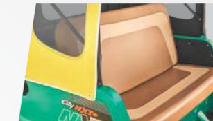
Dual Tone Seats