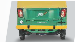
Stylish Rear Bumper