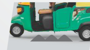
Higher Ground Clearance