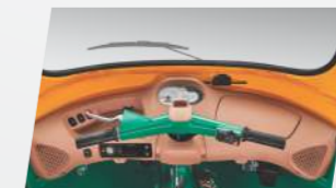
Multi Informative Display