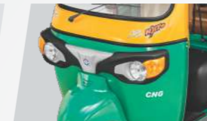
Stylish Front Fascia