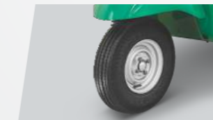
Tubeless Tyres First in 3 Wheeler Segment