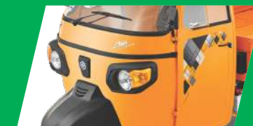
Attractive design and looks